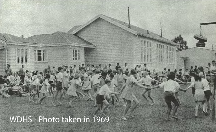
WDHS - Photo taken in 1969

An invitation is extended to everyone who attended Waipu DHS, both primary and secondary, from when it opened in 1939 (75 years ago) until it morphed into Bream Bay College on the present site in 1974. Students from 1974 onwards as well as Teachers/BOT/PTA/Support Staff & Friends of the College.