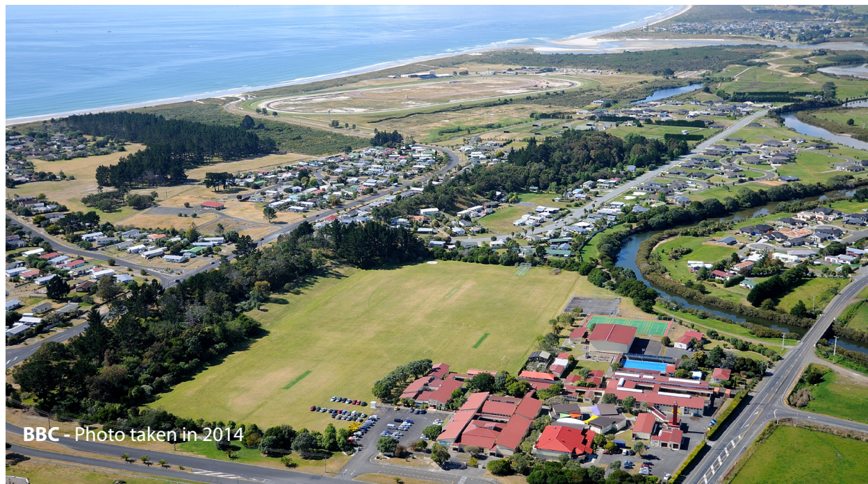
BBC - Photo taken in 2014